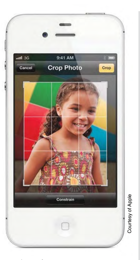
The iPhone 4S runs iOS 5, the latest version of Apple's smartphone software.

Smartphones are exploding in popularity. According to In-Stat, smartphones accounted for less than 20% of total handsets in 2010 but will account for 43% of all mobile phones by 2015. IDC predicts that smartphones will experience double-digit growth in the coming years as they snatch market share from feature phones.