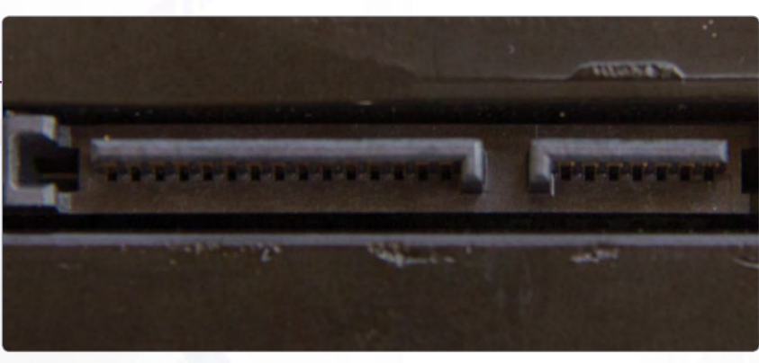
You'll need to connect SATA data and power cables to the back of your SSD.

Fortunately, there are a number of ways you can mount an SSD into a 3.5-inch bay. You can invest in a 3.5-inch to 2.5-inch adapter bracket that provides holes to securely mount your SSD; VELCRO's Sticky Back tape ($29.99; www.velcro.com) is another option. SSDs have no moving parts and don't need to be screwed into place like a traditional hard drive, so you could just apply the VELCRO tape to the 3.5-inch bay and the bottom of the SSD to secure the drive.