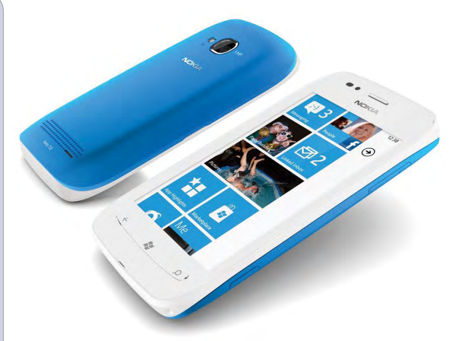
The Nokia Lumia 710 makes finding people and places easy and intuitive.

business-oriented smartphone needs to be more than just a mobile portal to Web and email. The Nokia Lumia 710 does that, but it also makes you a master of your Microsoft Office documents with builtin Word and Excel editing. Bing Voice Search makes finding what you want nearby a cinch, including mapped directions, phone numbers, reviews, and even what the traffic looks like between where you are and where you want to be. The intuitive People Hub lets you keep in touch with your family, colleagues, and more in one easy-to-use app that incorporates your contacts, social networking updates, and messaging functions into a few information-packed screens.