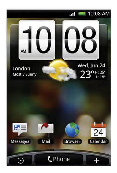
HTC's Sense user interface is used on a variety of Android-based smartphones from HTC.

Among Apple, Google, Microsoft, and RIM, smartphones offer a surprisingly uniform list of specifications, but there are a few features that set them apart. Apple's iPhones are renowned for being intuitive and let users manage and purchase audio and video content using the firm's iTunes software. Similarly, Microsoft's Windows Phone 7 devices use the Zune software to manage and buy content. Microsoft's phones also offer a unique user interface that favors large text and flat icons. One of the best things about Android-based