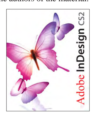
Adobe InDesign CS2 is used to publish PCC News

Contents © 2012 PC Community, except as noted. Permission for reproduction in whole or in part is granted to other computer user groups for internal, non-profit use, provided credit is given to PC Community and to the authors of the material.