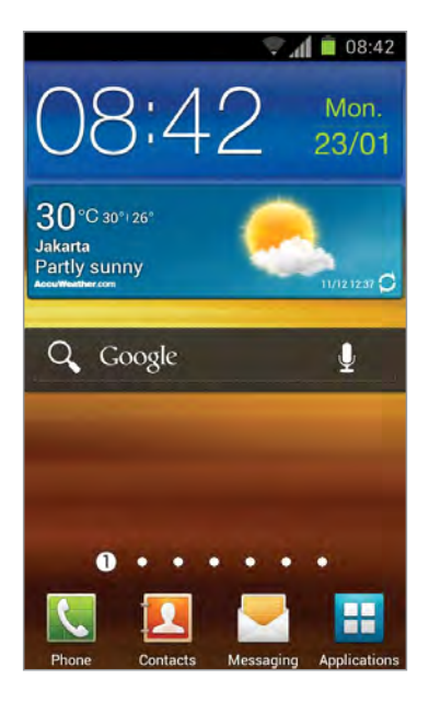
Samsung's TouchWiz user interface elements differ from that of stock Android.

Apple and RIM (Research In Motion) don't just make smartphone OSes, they also manufacture iOS-based iPhones and BlackBerry