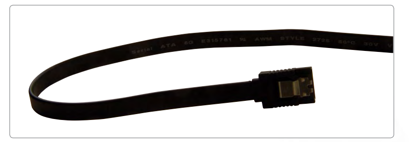
This SATA cable indicates that it supports 6Gbps transfer speeds.