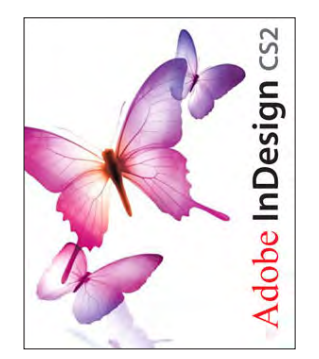
Adobe InDesign CS2 is used to publish PCC News

Contents © 2013 PC Community, except as noted. Permission for reproduction in whole or in part is granted to other computer user groups for internal, non-profit use, provided credit is given to PC Community and to the authors of the material.